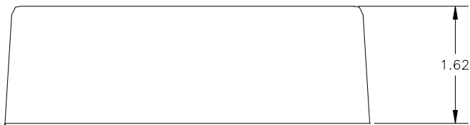
FRONT VIEW - COVER