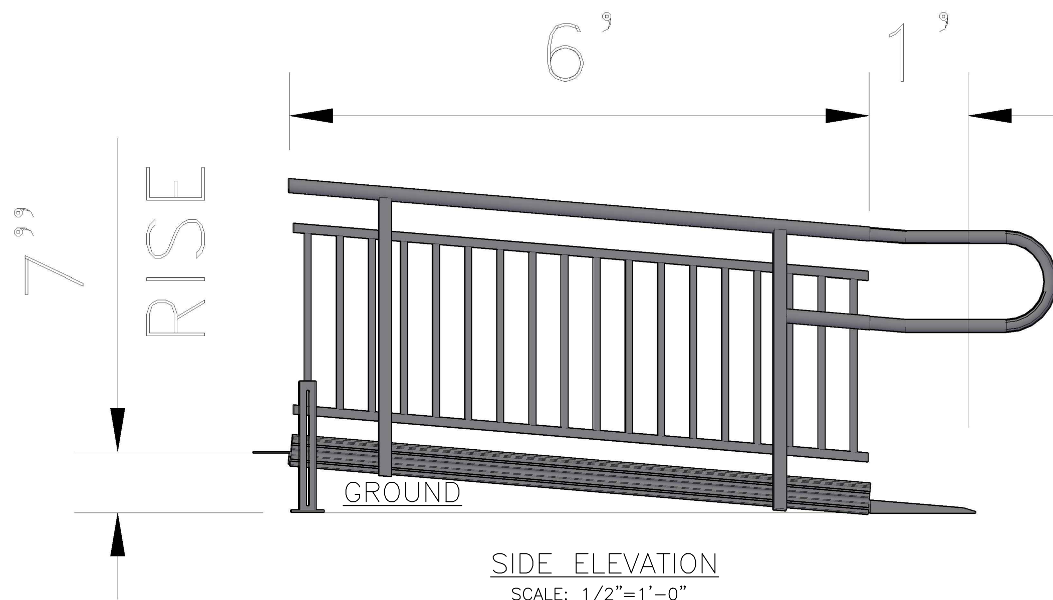
SIDE ELEVATION SCALE: 1/2"=1'-0"