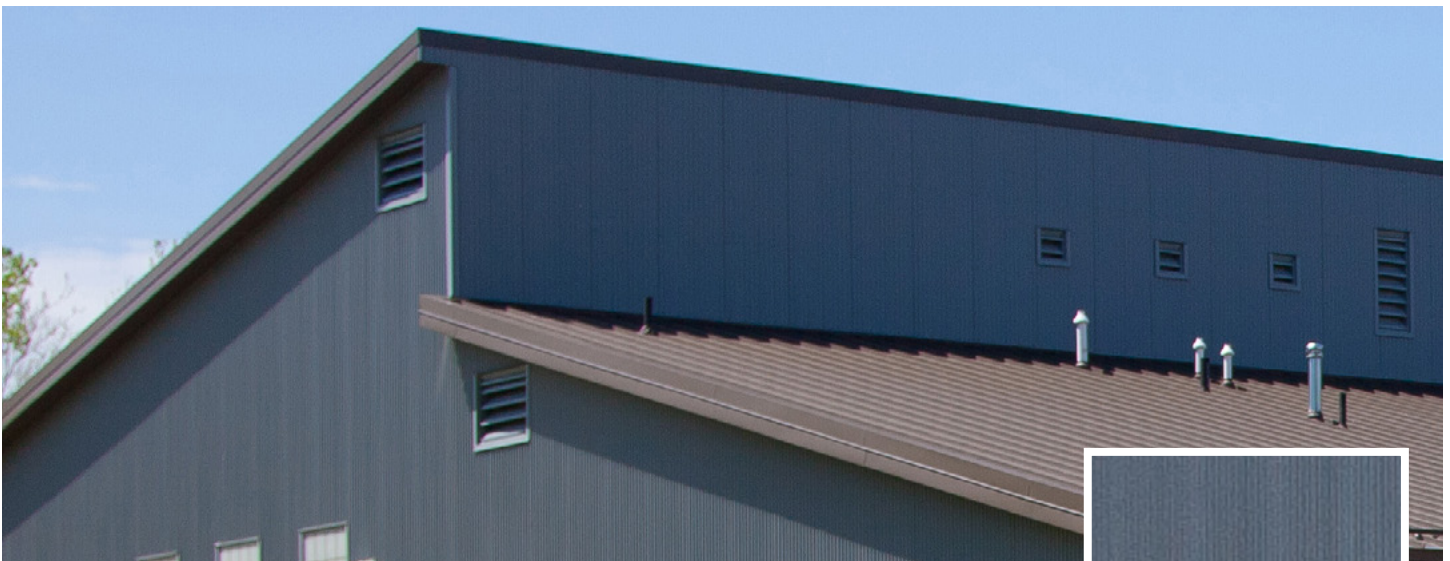
Allegan Water Treatment Facility, Allegan, MI, USA

"For the Allegan Water Treatment Plant, we conceptualized a barn-like feel to fit the context of the surrounding pastoral landscape. Metal was the first material that came to mind with its durability, low maintenance and color availability."