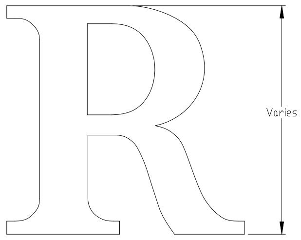
FRONT VIEW II SCALE 1:5

Radius varies based on size (0.015" - 0.135")