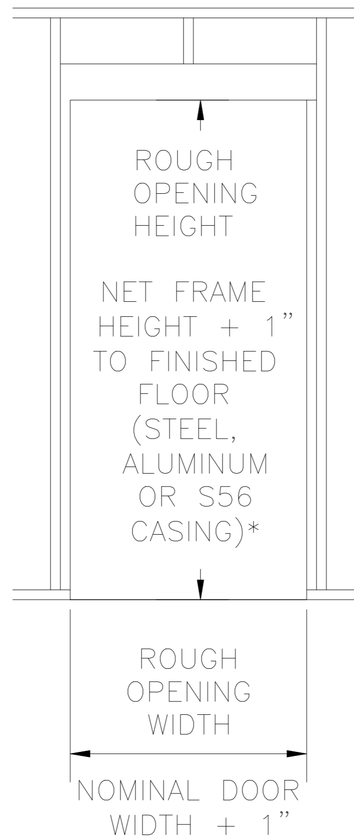
REDIFLEX FRAME ASSEMBLY

*NET FRAME HEIGHT + 1/2" TO FINISHED FLOOR WHEN USING WOOD TRIM