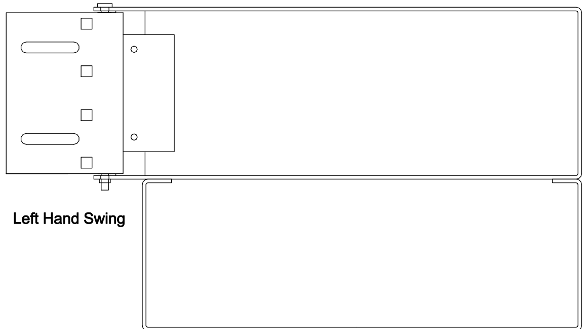
Left Hand Swing