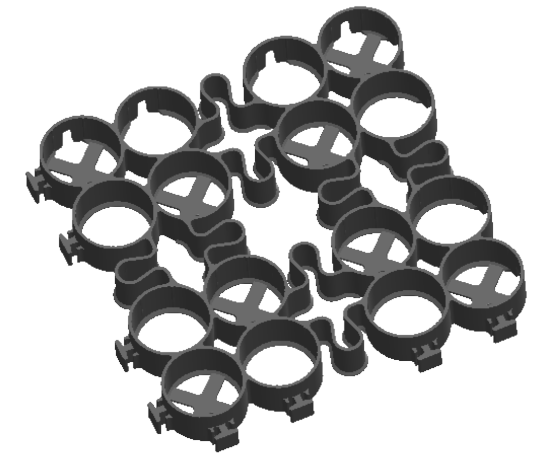
TRUEGRID BLOCK REFERENCE VIEW PREASSEMBLED & DELIVERED IN 4' X 4' SHEET. RECONFIGURED AS NEEDED. NO EXTRA TOOLING OR ACCESSORIES REQUIRED