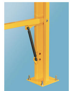
Safety Lock Mechanism, and Gas Struts for ease of operation

The standard sizes listed above are stock items. FabEnCo also manufactures custom safety gates for wider openings or unusual handrail configurations. Please contact us with your special requirements.